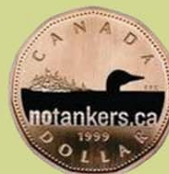
The story of the No Tankers decal, p.34