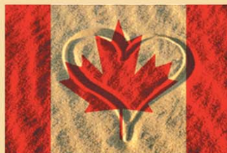
ABOVE: our flag in the sand... VOTE FOR NATURE! See Nature Canada's suggested questions to ask, p.15-16.

Long-term thinking needed, 5 Risky world of P3s, 19 Knocking over of Dief, 21 Representation in Parliament, 25 No recall, no democracy, 25 Electoral system change, 26 Serving the Common Good, 27 The final analysis, 34 Canada and Quebec, 40, 17 Two Glorious Virgins, a parable, 43